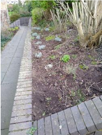
Fencing renewal ( Ingram Crescent )