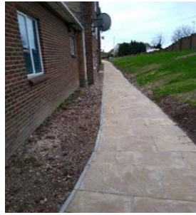
Provision of community facilities ( Ingram estate )