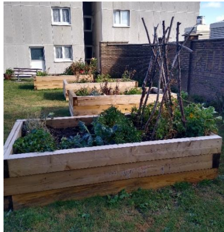
Pathway repairs ( Ingram Crescent )