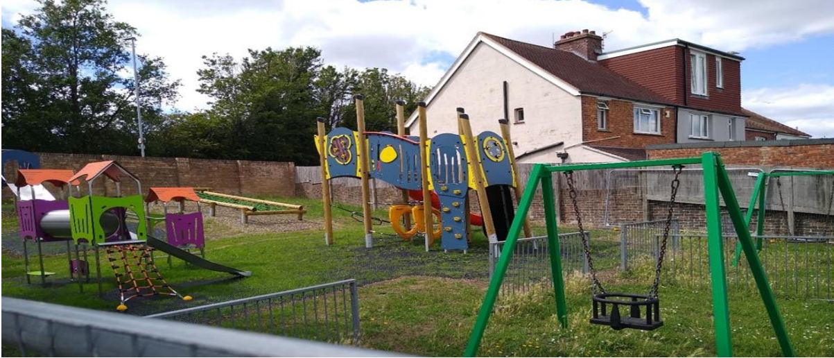
Clearance of shrubs blocking light ( Barclay House )